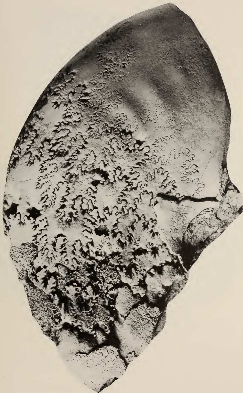
Fig. 4. Hatchericeras patagonense Stanton, 1901. OUM KX 1819. \times 1 .